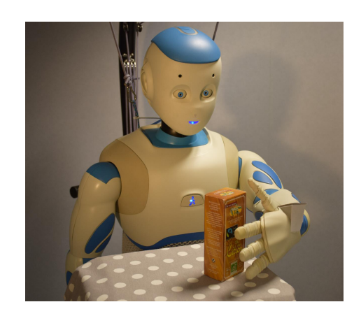
Figure 5. Romeo experimental platform.