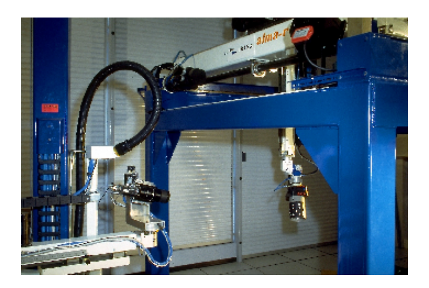
Figure 2. Lagadic robotics platforms for vision-based manipulation

Note that eleven papers exploiting the indoors mobile robots were published this year [16], [29], [30], [31], [33], [37], [43], [41], [42], [56], [58].