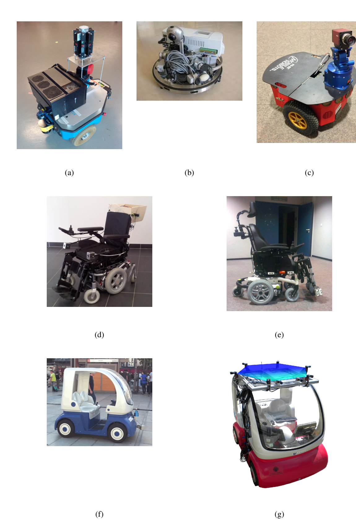
Figure 3. a) Hannibal platform, b) Robotino, c) Pioneer P3-DX robot, d) wheelchair from Penny and Giles Drives Technology, e) wheelchair from You-Q, f) Cycab available in Rennes, g) one of the Cycabs available in Sophia Antipolis.