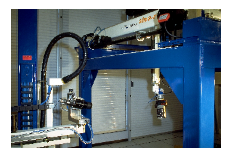
Figure 2. Lagadic robotics platforms for vision-based manipulation

Two papers published by Lagadic in 2012 enclose results validated on this platform. Note that it is also opened to researcher from other labs. For example, this year an associate professor from LSIIT in Strasbourg did experiments on the Gantry robot.